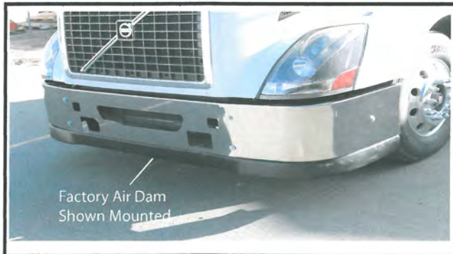
Factory Air Dam Shown Mounted

Brackets (both sides) installed only when mounting factory air dam center deflector