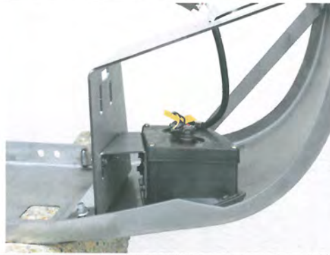
VCP light bracket & factory light mount to VCP Bumper Mounting Bracket