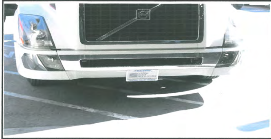
Factory Bumper Shown