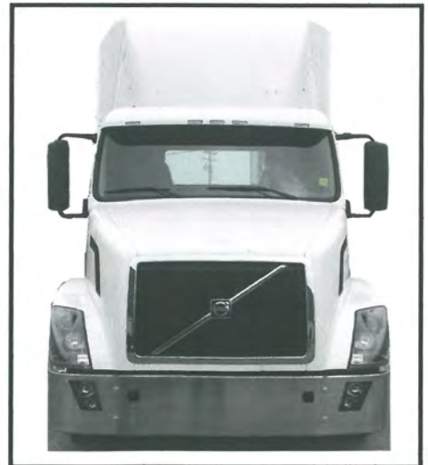
VCP Bumper Shown w/ Factory Lights Installed