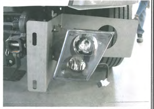
VCP Mounting assembly mounted to truck Do not tighten bolts until bumper is installed. (ready for bumper installation)