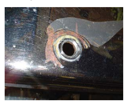
Chrome peeling on face and / or top flange of the bumper

Corrosion chrome or paint peeling / blistering, as shown in the following examples, is covered under warranty