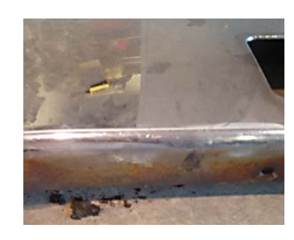
Corrosion on bottom flange of the bumper