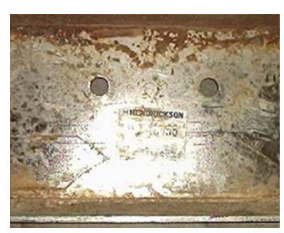
Corrosion on back side of the bumper