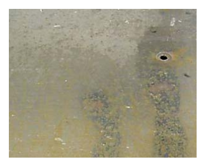
Orange / yellow corrosion distributed in relatively large areas