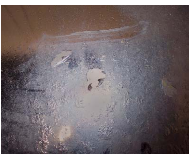
Blistering on face and / or top flange of the bumper