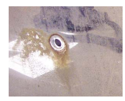
Corrosion anywhere on the bumper due to use of improper hardware or improper installation and / or service practices